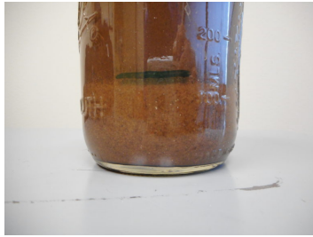
Jar showing the coarse sand layer settled at the bottom of the jar.

3. Fill the remainder of the jar with clean water, but leave some space at the top.