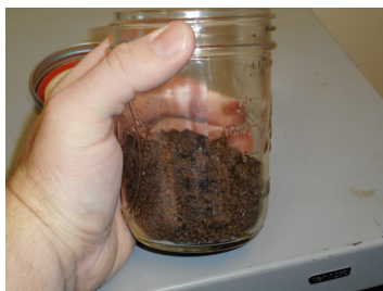
Jar filled a \frac{1}{3} of the way full with soil.