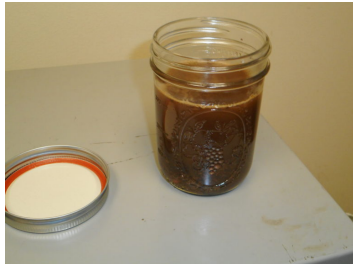
Jar filled with water, leaving space at top.

3. Fill the remainder of the jar with clean water, but leave some space at the top.