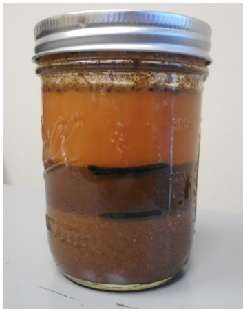
Jar showing the silt layer.

7. Place a mark the outside of the jar, showing the coarse sand layer settled at the bottom of the jar.